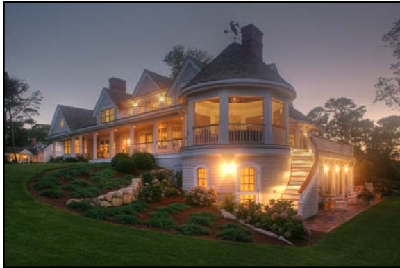
NEW HOUSE IN SOUTH ORLEANS DESIGNED BY: ARCHITECTURAL DESIGN FOREMAN: KENNY MARTIN