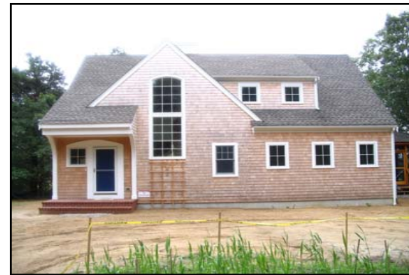
NEW HOUSE DESIGNED BY: PETER CONEEN FOREMAN: MIKE DENTON

The paint department is ready to schedule interior painting for November through March. Do you have well-used painted or dark wood stained kitchen or bathroom cabinets? How about old wrought iron colonial style hinges and handles that do not look good anymore, are slightly rusted and do not match anything in the house? We can remove the doors and drawers and apply a new painted finish at our paint shop, paint the cabinet faces in the kitchen, clean the interiors and do all this work in less than a week. Need the entire interior of your home painted? We can take photos of each and every wall before we start, safely pack away the contents of that room and reassemble it after the painting has been completed. We have a responsible foreman on the job each day to insure this procedure. Please call me at the North Eastham office for details and if you have any questions.