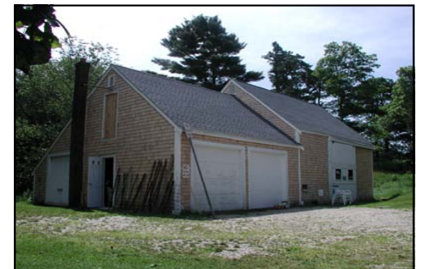
NEW ROOFING AND SIDING FOR CAPE ABILITIES NEW FARM FACILITY IN MARSTONS MILLS

Cape Associates, Inc. P.O. Box 1858 North Eastham, MA 02651