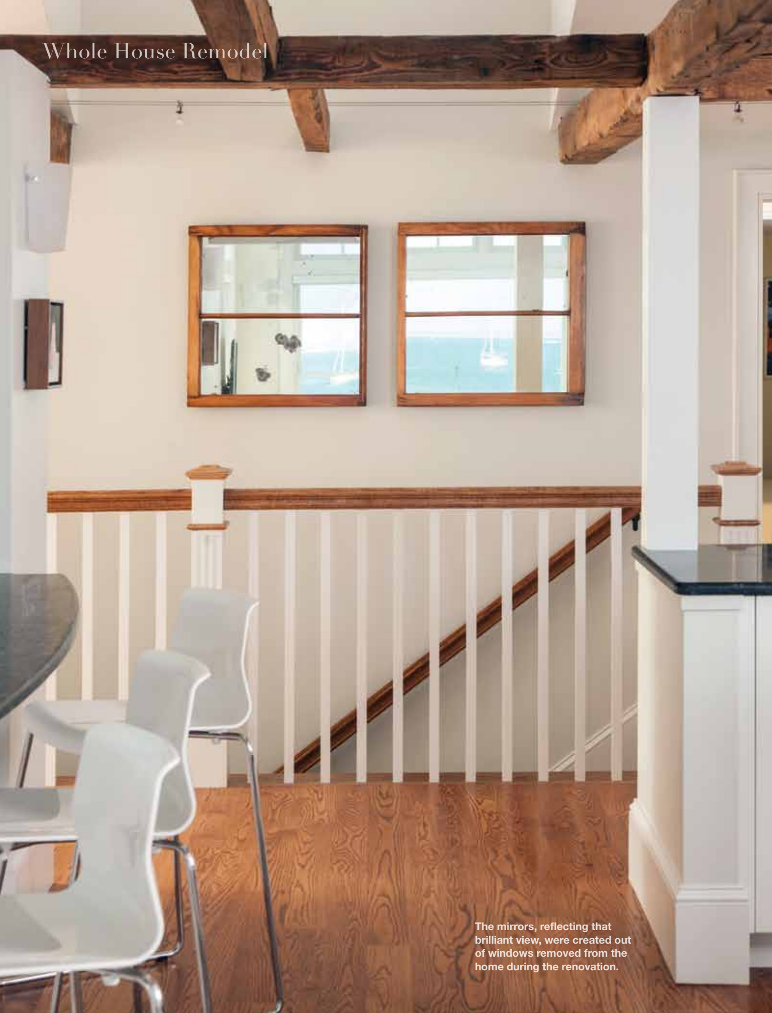
The mirrors, reflecting that brilliant view, were created out of windows removed from the home during the renovation.

“One of the most tranquil rooms in the home is the master bedroom suite with its own private deck opening to stunning water views,” says Cole. The owners enjoy the master bathroom with its large soaking tub, double sinks, and walk-in shower with built-in niches and tile floor. “The house has many modern finishes while maintaining the character of the home such as the exposed beams in the kitchen and dining area.”