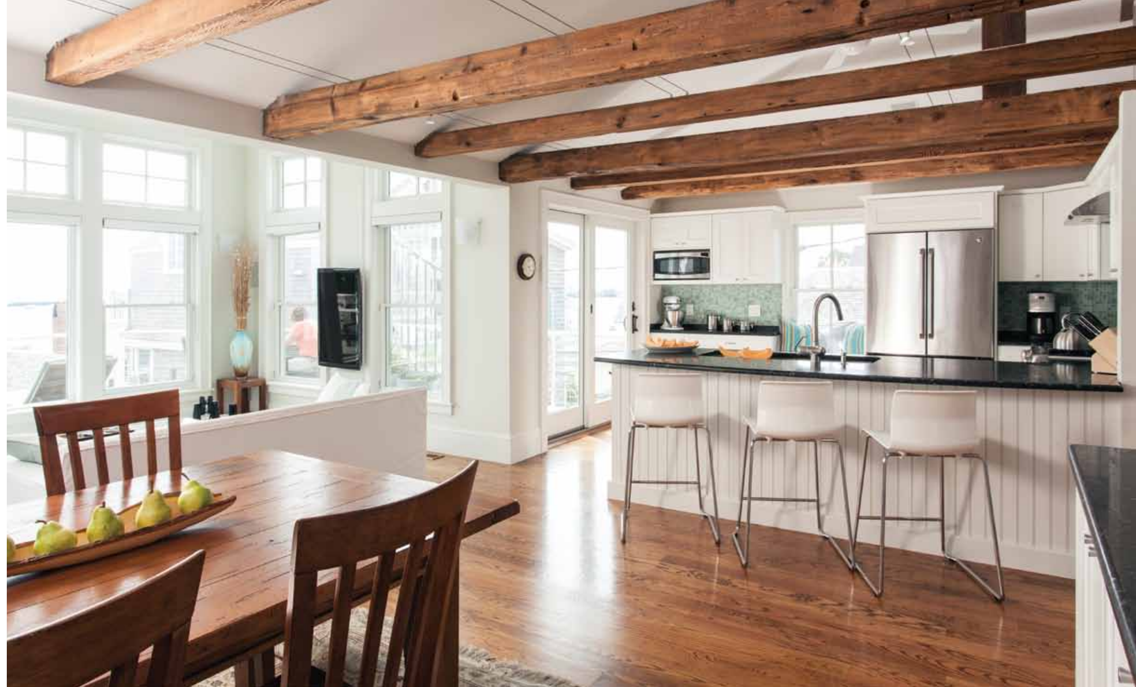
Left; top: White cabinetry and honed black granite countertops pop against the warm wood flooring and stainless appliances. Left; bottom: The kitchen's window seat was a necessity to accommodate structural changes; now it's a favorite spot.

"We knew we wanted to start with a great waterfront location, which the home had," says Pam. "We worked with Manitu Architects immediately upon signing the purchase and sales agreement and described to them how we wanted to use the house, what specific features we wanted, and that we absolutely had to maximize the view." The architects were familiar with waterfront and beach property renovations so the planning process went smoothly as the couple articulated what they wanted in their new vacation home.